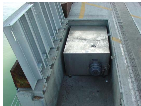
Wharf-side Electrical Vault

A major challenge to the ship shore-power program is the lack of standardized voltage and frequency. Different voltages (e.g., 440 V, 6.6 KV or 11 kV) are used on different ships and different frequencies (e.g., 50 Hz vs. 60 Hz) are used at different ports around the world. Electrical demands (1 MWe to 8 MWe) are different for different types of ship. Also, there is no standardized shore-power connect as of