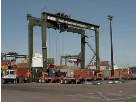
Container Terminal

Port of Texas City, the Port of Galveston, and the Port of Freeport. A total of 6,435 vessels called in the Port of Houston in 1997. The majority (over 40%) were tankers. However, only 17% of ships calling the Port of Houston in 2000 called more than five times in that year. According to the air emission projections by Texas Commission on Environmental Quality (TCEQ), vessel emissions accounted for approximately 5% of total NO x emission in the Houston-Galveston area in 2007. Of this 5%, approximately half of the NO x emissions are from vessels at-berth.