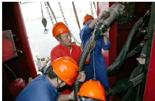
On-board Cable Connection

For the China Shipping Terminal AMP™ system, an industrial substation was installed with necessary components (i.e., meters, switching gears, transformers, etc.) to receive electricity at 34.5 kV from DWP with a voltage step down to 6.6 kV. Electrical conduits were installed underground to bring cables to the wharf-side electrical vaults where cable connections can be made when a ship was at dock. A barge equipped with a cable reel and a transformer is used for cable connection. A second transformer was used to bring the voltage down further, from 6.6 kV to 440 V. This is required