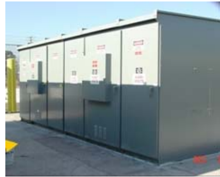
Shore-side Infrastructure

A shore-power system requires industrial substations and power transmission lines to bring power from a local grid to the port. At the terminal, the berth requires installing electrical cables and conduits, wharf-side electrical vault and connectors for ship connection. For a new terminal to be designed with shore-power capabilities it is likely to be less cost-intensive and the engineering can be included in the terminal design and hence be an integral part of the design. However, for an existing terminal, it does pose significant financial and engineering challenge, as major improvements or modifications of the existing terminal and its operation require disruption prevention schemes.