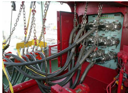
On-board Cable Connection

An on-board shore-power system consists of receptacle panels, voltage switching board, circuit breakers, and control and monitoring system. Depending on the frequency and voltage of a shore-power supply and a ship's electrical systems, a second transformer to bring voltage further down from the shore-side power system and/or an electrical frequency (i.e., 50 Hz vs. 60 Hz) converter may be needed.