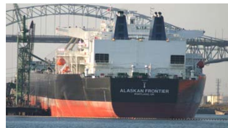
Tanker Terminal

According to the Port of Long Beach's 2005 Green Port Annual Report 14 , British Petroleum (BP) voluntarily worked with the Port of Long Beach to initiate a voluntary project to install shore-power at Berth T121, along with wiring and plugs on two BP tankers, which will use shore-power whenever they call in Long Beach. This agreement was reached through a terminal lease negotiation. This project is expected to reduce emissions by at least 2.2 tons of NO x and 0.8 tons of diesel PM each year.