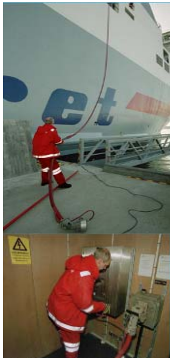
Ro-ro Cable Connection

In Sweden, Stena Lines ferries used shore-power connection with 400 V low voltage cable connections prior to 2000. The first ro-ro ferry shore-power connection with high voltage electric cable was installed in 2000 and was the result of cooperation between the Port of Göteborg AB and StoraEnso 17 (a Swedish paper company). The ro-ro terminal was used by DFDS Tor Line AB which provided regular scheduled trips between Port of Göteborg and Immingham, England, and between Port of Göteborg and Ghent, Belgium. The shore-side electricity was provided with a 10 kV high voltage cable and an on-board transformer to step down voltage to 400 V. Furthermore, part of the electricity supplied to the ro-ro terminal was generated by wind power. According to the Port of Göteborg, the use of shore electricity reduced annual air emissions by 80 tons of NO x , 60 tons of SO 2 and 2 tons of PM. The Port of Göteborg currently has two passenger and ro-ro ferry terminals (DFDS Tor Line and Cobelfret)