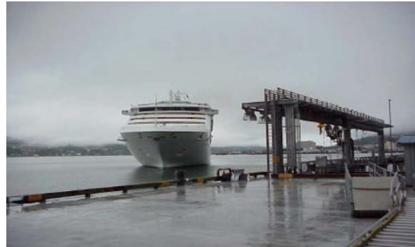
Cruise Ship Shore-Power

On the ship-side, cables are connected using male/female plug-and-socket system for easy handling. On-board power management software was used to automatically synchronize, combine and transfer. While synchronization of the ship with shore-power is mandatory for passenger ships, any disruption of power to passenger services is not acceptable.