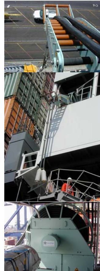
6.6 kV On-board Cable Connection

Evergreen Marine has built a fleet of vessels that are AMP™ capable. These new vessels are a larger type container ship with a capacity of 7,024 TEUs. Cost for an on-board cable management and AMP™ system was approximately $2 million per vessel. The system employs an automatic synchronization of the power transfer system. The Port of Los Angeles plans to invest $1.7 million for shore-side infrastructure upgrades to accommodate an AMP™ system at Berth 231. The actual construction is expected to begin in the first quarter of 2008. One reason why costs at NYK and Evergreen terminals are low in comparison to the China Shipping project is that in the NYK and Evergreen terminals existing space conduits were utilized to pull the high voltage cables from the back of the terminals to a point near the wharf. The existing conduit eliminated the need to trench 2,000 feet to install the high voltage cables.